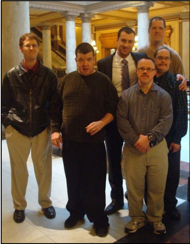
SEN. CARLIN YODER visits with the ADEC group.