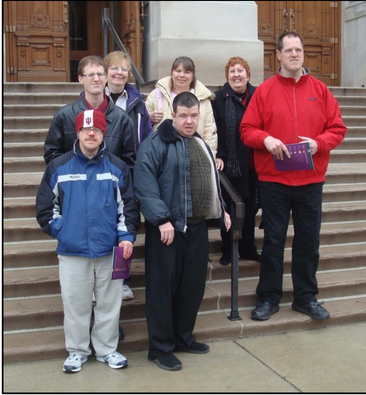
EXITING the State House at the end of a busy day.